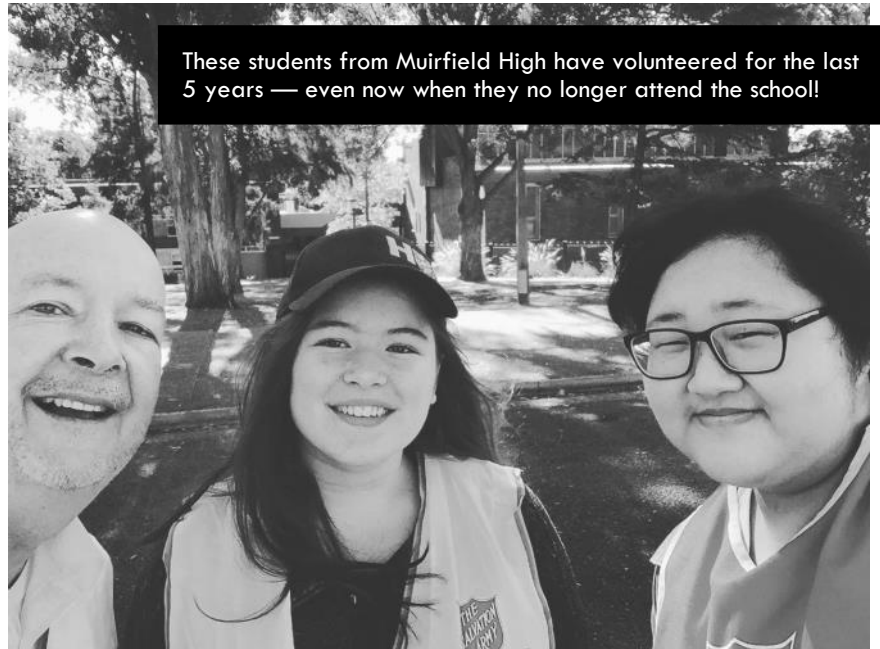
These students from Muirfield High have volunteered for the last 5 years — even now when they no longer attend the school!