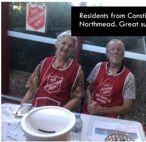
Residents from Constitution Hill Retirement Village volunteered at Bunnings Northmead. Great support again from The Kings School students.