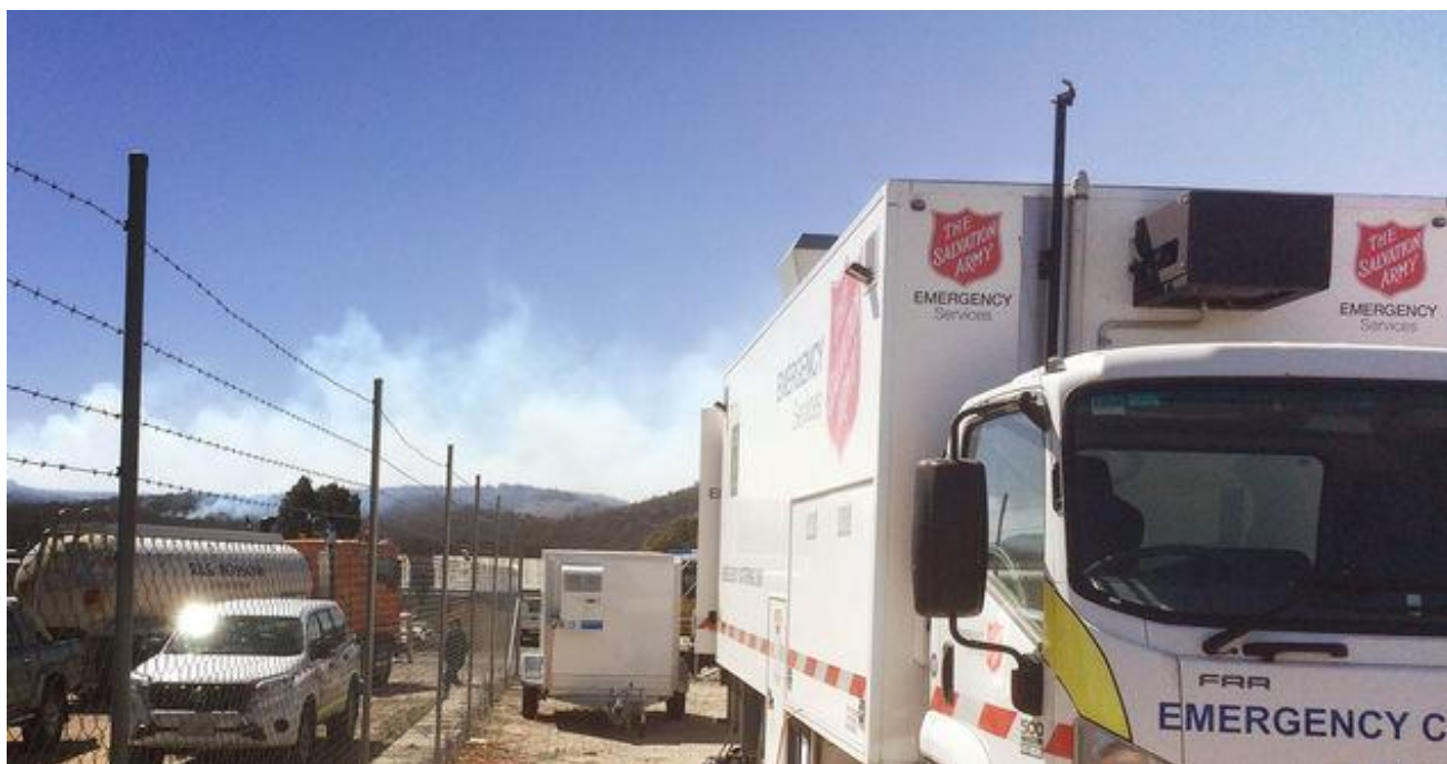
Salvos emergency services team at Stanthorpe.