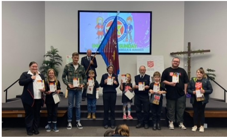
Our newest Junior Soldiers and their Big Buds

Come have a chat, play games and pick up some bread. Monday, Wednesday or Friday 9.30 - 1.30pm