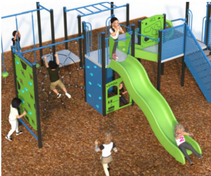
new playground to be installed mid July