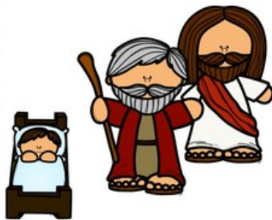
Jesus Heals an Official's Son John 4:43-54

Maryborough NAIDOC event at the Pony Club. Coffee and Tea served by our SAES Team and our faithful truck Woolie. Well done team.