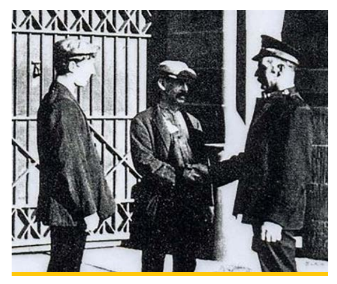
The Salvation Army's Prison Gate Brigade program in the early 1900s.

As a national mission expression now, Salvation Army Housing seeks to transform the lives of those experiencing housing hardship and injustice by providing low-cost accommodation, supporting those experiencing or at risk of homelessness, as well as socially disadvantaged members of our communities.